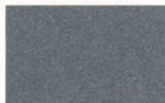
Medium Grey Metallic