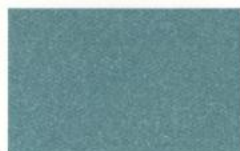
Medium Turquoise Metallic