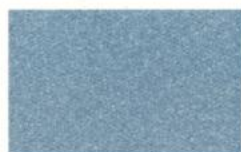
Diamond Blue Metallic