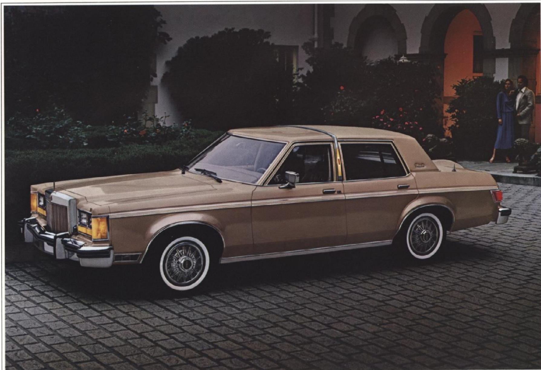
1980 Lincoln Versailles in Light and Medium Fawn Metallic Dual- Shade paint option and Coach roof