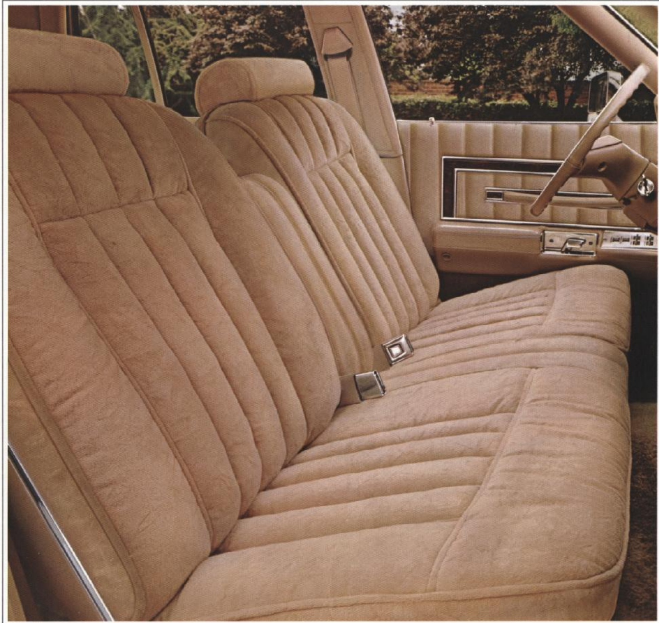
Versailles standard Twin Comfort Lounge seat interior

To fully appreciate Versailles, you must also experience its ride. Versailles is, as you would expect of a Lincoln, engineered and created to provide total driving pleasure.