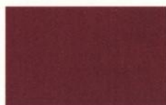
Dark Red Metallic