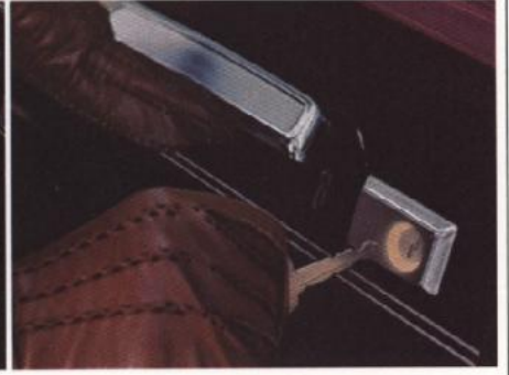
1980 Lincoln Versailles in Cordovan with Cavalry Twill vinyl half-roof