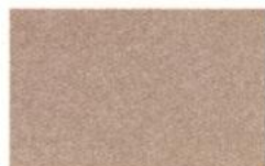
Light Fawn Metallic