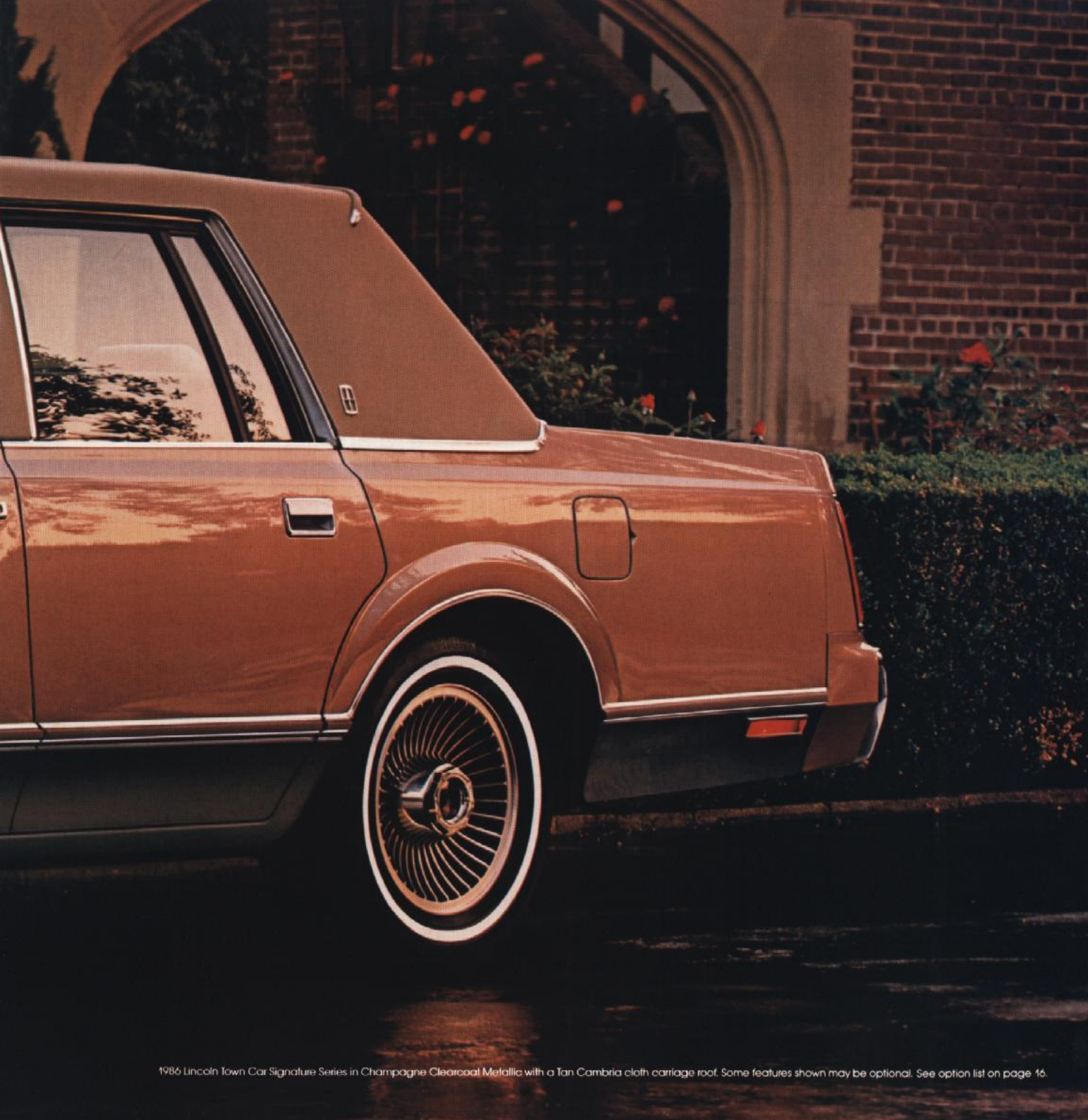
1986 Lincoln Town Car Signature Series in Champagne Clearcoat Metallic with a Tan Cambria cloth carriage roof. Some features shown may be optional. See option list on page 16.